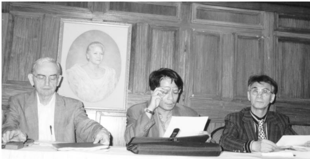
WDA:Asia Pacific Annual General Meeting, August 2, 1998 Trader's Hotel, Manila